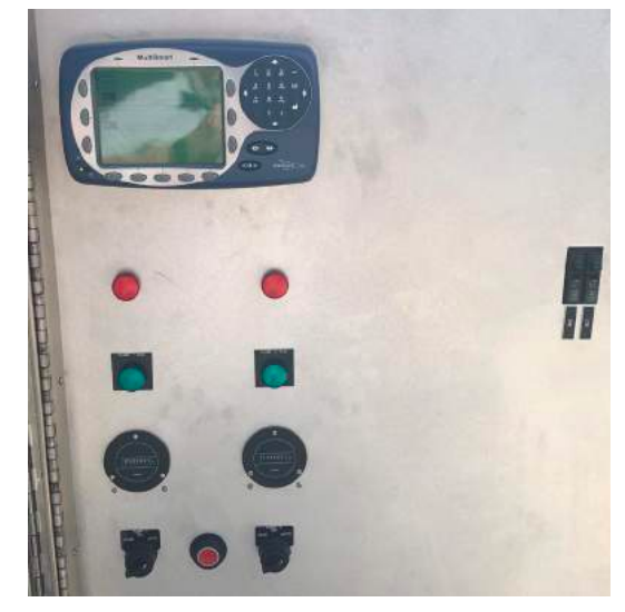
The MultiSmart IPSM with touch screen collects more than 400 sophisticated data points at each site for Lowndes County.

The insulation resistance (I/R) test feature has already helped the utility identify potential problems that could have resulted in catastrophic pump failure. In one such situation, the I/R test feature helped identify an issue that would have allowed water into the conduit system. Had the problem not been detected and resolved, Stalvey said pump replacement costs could have cost the utility as much as $40,000.