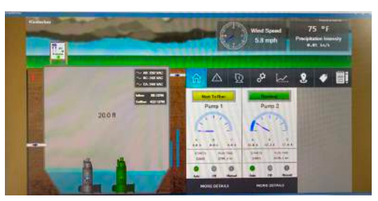
The remote Flygt Cloud SCADA screen at the Kinderlou Lift Station saves Lowndes County time and money by providing them real-time data during a storm event, eliminating the need to send personnel to a site during a storm