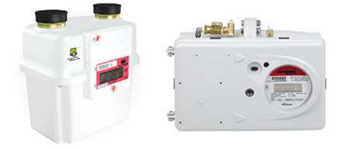
Figure 3. The Sensus Sonix IQ ultrasonic meter for residential class use (250 and 400 CFH), weighs about 6 lb.

stiffen, shrink or change shape with changing temperatures, accelerating wear and tear. The solid-state construction of ultrasonic gas meters means greater resistance to freezing