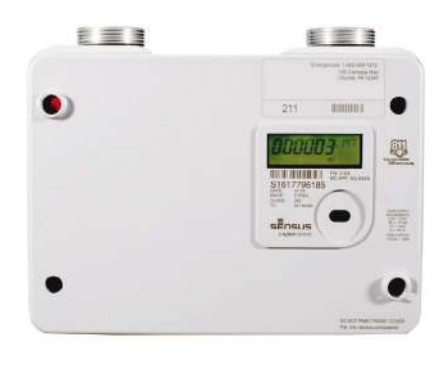
Figure 1: The Sensus Sonix IQ ultrasonic meter for residential class use (250 and

The ultrasonic gas meter is now poised to be a gamechanger in residential gas metering. Future-forward gas utilities that adopt this technology can leverage its advantages to increase process efficiencies and 400 CFH), weights about 6 lb. Source: hone a competitive advantage in the smart gas sensus landscape.