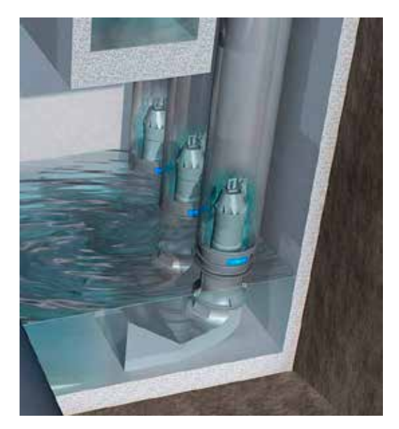
Pump station model/image

In 2012, torrential rains hit the Chihuahuita historic district of El Paso, and this time the results were different. With the new pump station in place and functioning well, flooding was not an issue, bringing much-needed relief to this historic area.