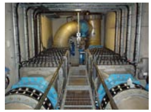
Detail: Installation Stockholm Vatten, water works Lovö I