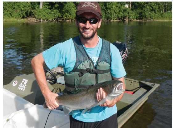
As proof of the environmental gains, residents and tourists are again now fishing for salmon and steelhead in the St. Joseph River without trepidation.