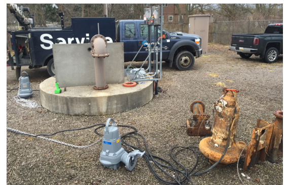
Concertor on the site, ready for installation

Customer: The Genesee County (MI) Drain Commissioner, Division of Water & Waste Services (GCDC-WWS)