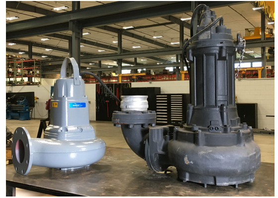
New versus old 10HP pump

On this retrofit project, elimination of the variable frequency drives resulted in a huge reduction in both installation and equipment costs. Additionally, the Energy Minimizer functionality of the integrated pump controls significantly reduces operating energy costs.