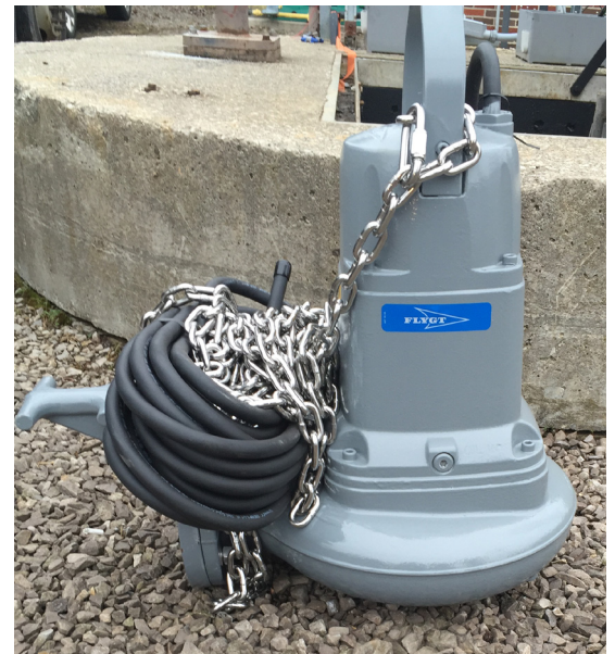
Flygt Concertor 10HP

GCDC-WWS no longer wanted to throw good money at old technology, so they turned to their Xylem distributor and trusted supplier Kennedy Industries for answers and a more permanent solution. Pump Station #8 was the perfect place and time to introduce Xylem's new Flygt Concertor, a smart wastewater pumping system that senses the operating conditions of its environment, adapts its performance in real time, and provides feedback to pumping station operators.