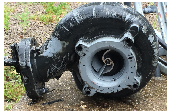
Concertor on the site - visual inspection after 6 months of operation - hydraulic end same as new