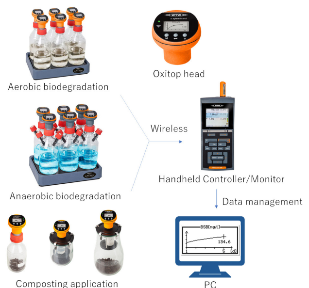
Fig. 1 OxiTop® for biodegradation

Vmax: The maximum theoretical volume of the biogas (CO 2 + CH 4 )