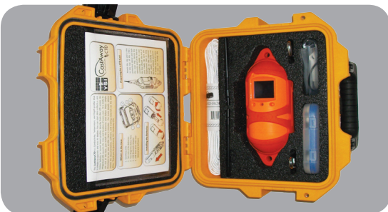
Rugged CastAway-CTD storage case