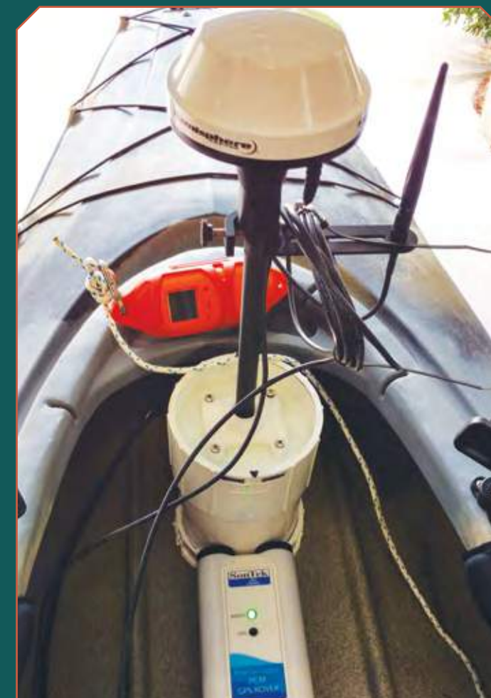
The PVC sleeve contains a SonTek M9, used to survey the lake bottom; the orange SonTek CastAway provided quick conductivity, temperature and depth data for correcting sound-speed variations.

"I would never collect data without using a CTD profiler," he adds. "And since I was on a kayak, the CastAway CTD was ideal due to its size and built-in GPS."