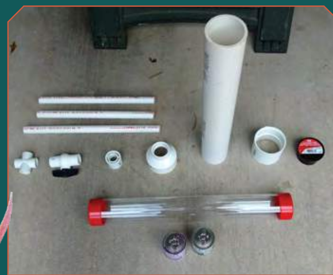
Down to the bottom of his budget, Bret Webb built his own sediment sampler from PVC plumbing parts.

HydroSurveyor mode is optimized for depth measurement, with less emphasis on velocity, and displays real-time and historical data on a map. That makes HydroSurveyor mode better suited for bathymetry. Users specify the package they want when they purchase an M9, and can unlock the other mode if their needs change—for instance, if they need to switch from river measurements to lake bathymetry surveys.