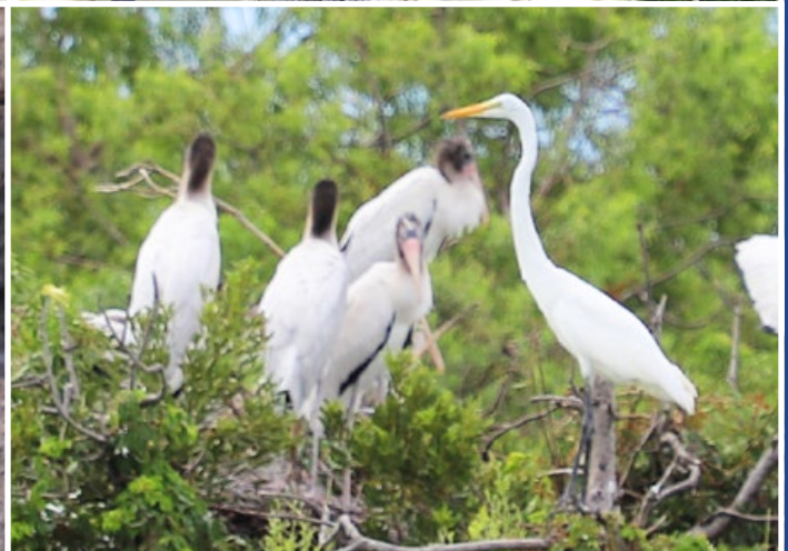
The Lodge on Little St. Simons Island (top) welcomes up to 32 visitors at a time. Local fauna (bottom), fiddler crabs and their natural predators.