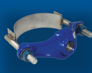
315 Service Saddle