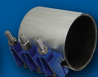
226 Full-Circle Repair Clamp