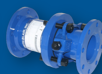
973 Dismantling Joint

Smith-Blair, Inc. Phone: 870-773-5127 • 800-643-9705 Fax: 870-773-5212 • 800-648-6792 www.smith-blair.com