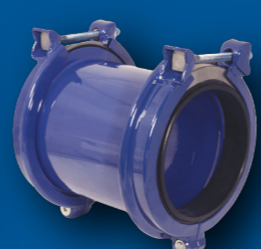
421 Top Bolt Coupling