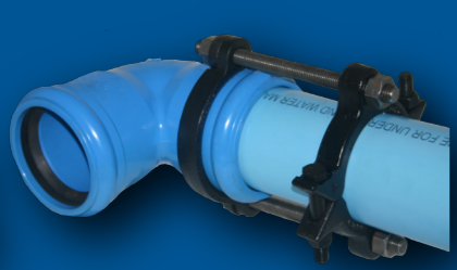
136 Bell-Lock Joint Restraint