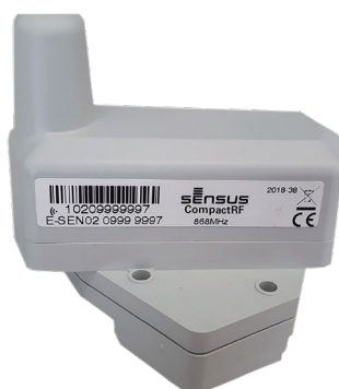
CompactRF® Clip on radio module to retrofit Sensus water meters with SensusRF