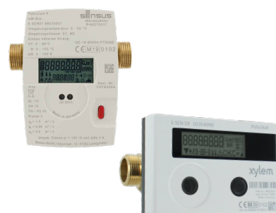
PolluCom® F and PolluStat® Mechanical and ultrasonic thermal energy meter