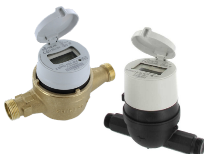
640/640C/640MC Mechanical water meter with eRegister, available in composite and brass body