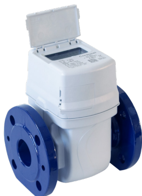
Cordonel® Solid-state commercial and industrial water meter