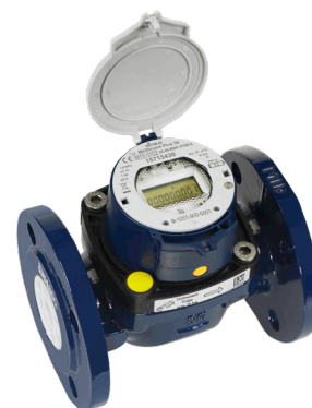
MeiStreamRF® Commercial and industrial water meter with electronic register