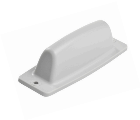
Antenna wall fin for Connect / Chatter