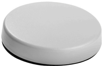
Antenna, big, flat, vandal- safe for Connect / Chatter