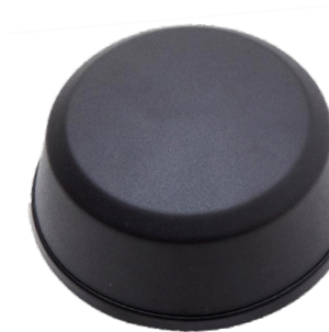
Antenna with extra gain, vandal-safe for Connect/Chatter