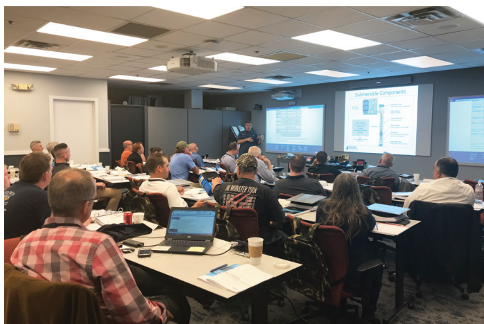
Students learning about submersible components in a class