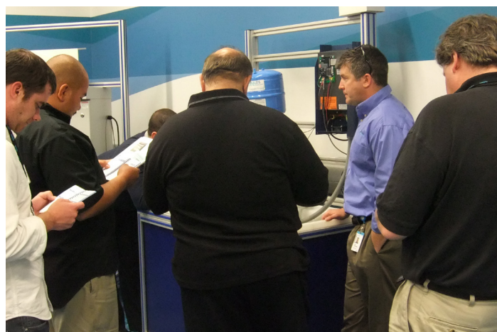
An instructor leading a session on a VFD