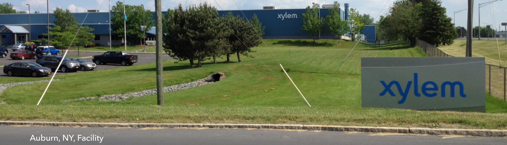
Auburn, NY, Facility