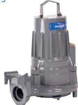
Flygt M 3068.170