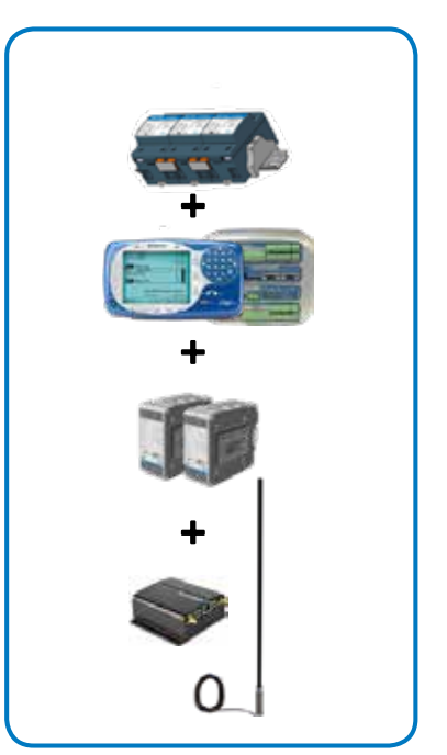
* Retrofit kit includes MultiSmart controller, DP gateways, surge protector, modem kit with antenna, power supply and battery