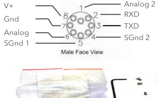
Foil Service Kit 4733/4794. PSt,