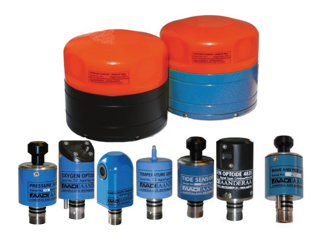
Available AiCap sensors. Top left: Doppler current sensor 4420, Doppler current sensor 4520. Bottom left: Pressure sensor 4117, Oxygen Optode 4330/4330F, Conductivity sensor 4319, Temperature sensor 4060, Tide sensor 5217, Oxygen Optode 4835, Wave & Tide sensor 5218.

Supply Voltage: 6- 14 Vdc Operating Temperature: -5 to +40°C Accessories Included: SeaGuard Studio SD card: 2 GB 1 Alkaline Battery 3988 Documentation on CD Accessories not included: Carrying handle 4132, 4032, 3965 Morring frame 5031,5031A In-line mooring frame 4044/ 3824A, Protecting Rods 3783 Bottom mooring frame 3448R Internal Lithium 3908 Internal Alkaline 3988 Internal Battery Shell 4513 Maintenance Kit 3813/3813A Tool kit 3986A Real-Time Collector 4715 and license Analog cable/license 4564/ 4802 AC/DC adapter for lab. use 4908 Sensor Cable 4865 to PC Real Time signal/power cable 5071/5072