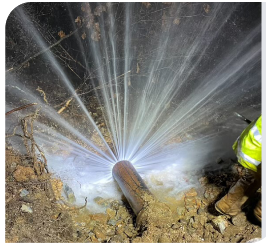
Aging infrastructure is a critical issue that Xylem helps solve with remotely managed meters and advanced leak detection.

Hot Springs reduced their non-revenue water (NRW) from 44 percent to 24 percent with the use of AMI and acoustic listening devices. The advanced technology is credited for the utility’s impressive improvement—cutting its water loss close to half. The goal is to reduce NRW to 20 percent within the next year, eventually aiming for 10-12 percent within the bounds of good water management.