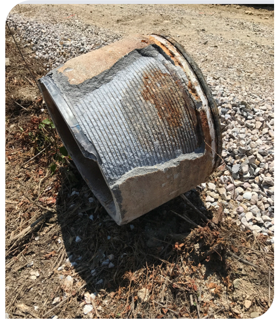
Hot Springs field technicians quickly located an issue with this 24-inch prestressed concrete pressure pipe thanks to advanced leak detection technology.