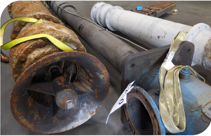
Repair Shop at Tencarva